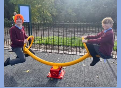
Y6 ambassadors represented Little Heaton at the opening of the new Rhodes Play Area on Thursday this week.